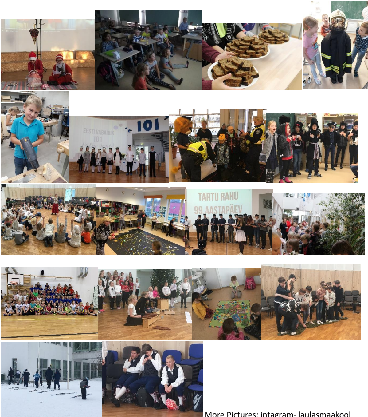
More Pictures: intagram- laulasmaakool

Working experience is not required. Most importantly the volunteer should be ready to work with children and have optimistic, tolerant and cheerful nature. All sorts of artistic, musical, pedagogical or sports related skills are welcome as they can be implemented educational and extra curricular activities of the school.